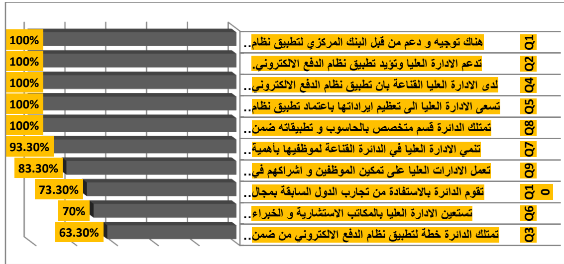
Figure (2) Distribution of paragraphs of regulatory requirements according to the proportion of availability